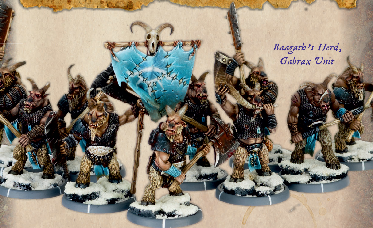
Baagath's Herd, Gabrax Unit

Units are the basic building blocks of hosts within Darklands. A unit can be a group of warriors that act together as a single entity upon the battlefield, a single warrior acting independently or even a group of two or more units that act in unison.