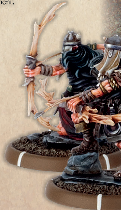
Bows of Carn Dinas, Bow-Drune Unit